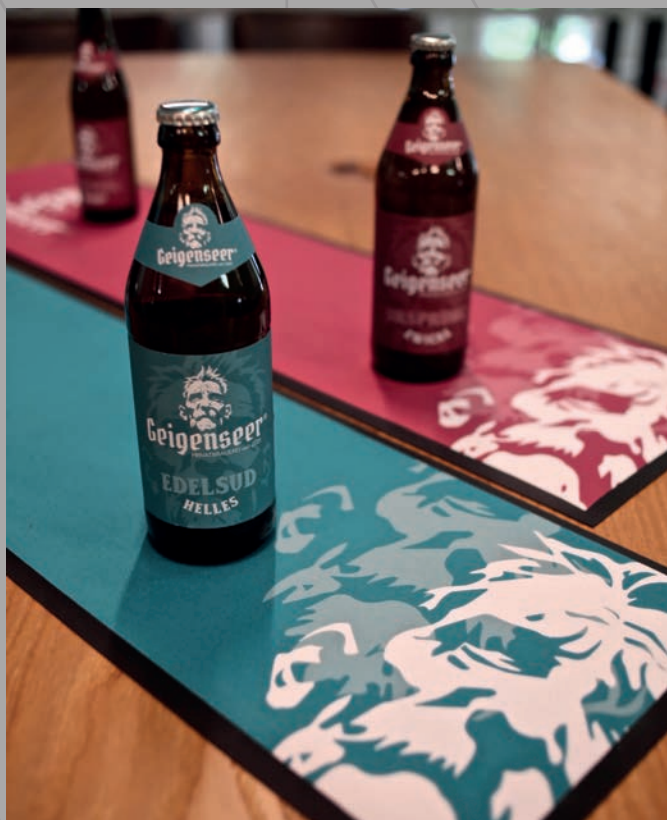
Photo-realistic bar runners - small mat - big message.

Subli-Mat Bar combines functionality with brand visibility – making it the perfect mat for bars, beverage stations or branded drink promotions. With CMYK sublimation printing, your brand message or signature product is displayed in razor-sharp quality. Its fine polyester surface absorbs light spills and splashes, and the mat is washable, flat, PVC-free and durable – ideal for everyday use in hospitality environments. Minimum order: 25 pieces.