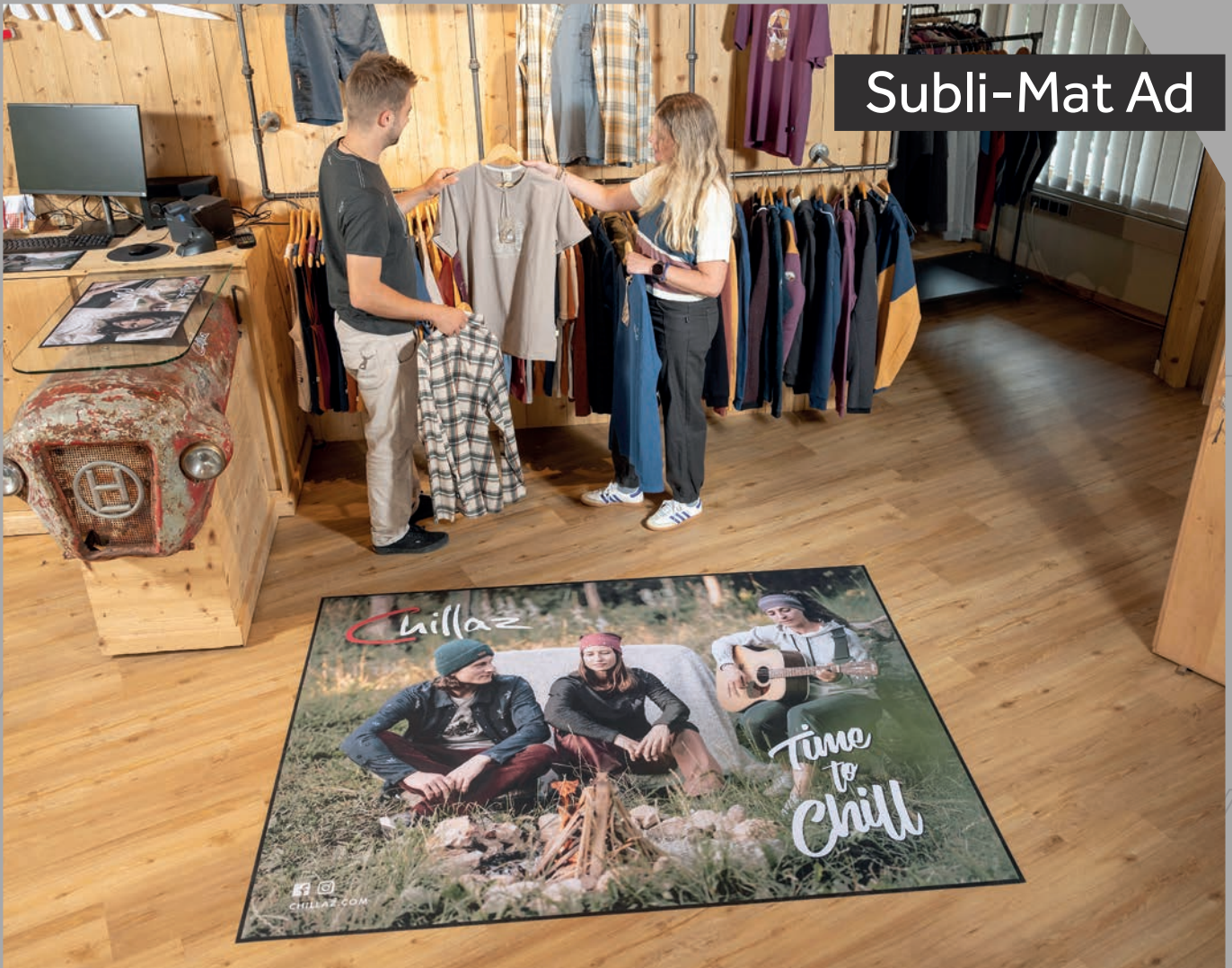
Photo-realistic floor posters for promotional impact.

Ad-Mat Premium puts your campaign right at your customers' feet – with razor-sharp graphics printed in full CMYK sublimation. Perfect for the point of sale, this flexible floor mat draws attention where it matters most. Its slip-resistant, PVC-free backing keeps it in place without the need for adhesive – and leaves no residue when removed. Easy to handle, visually impactful and available in custom shapes.